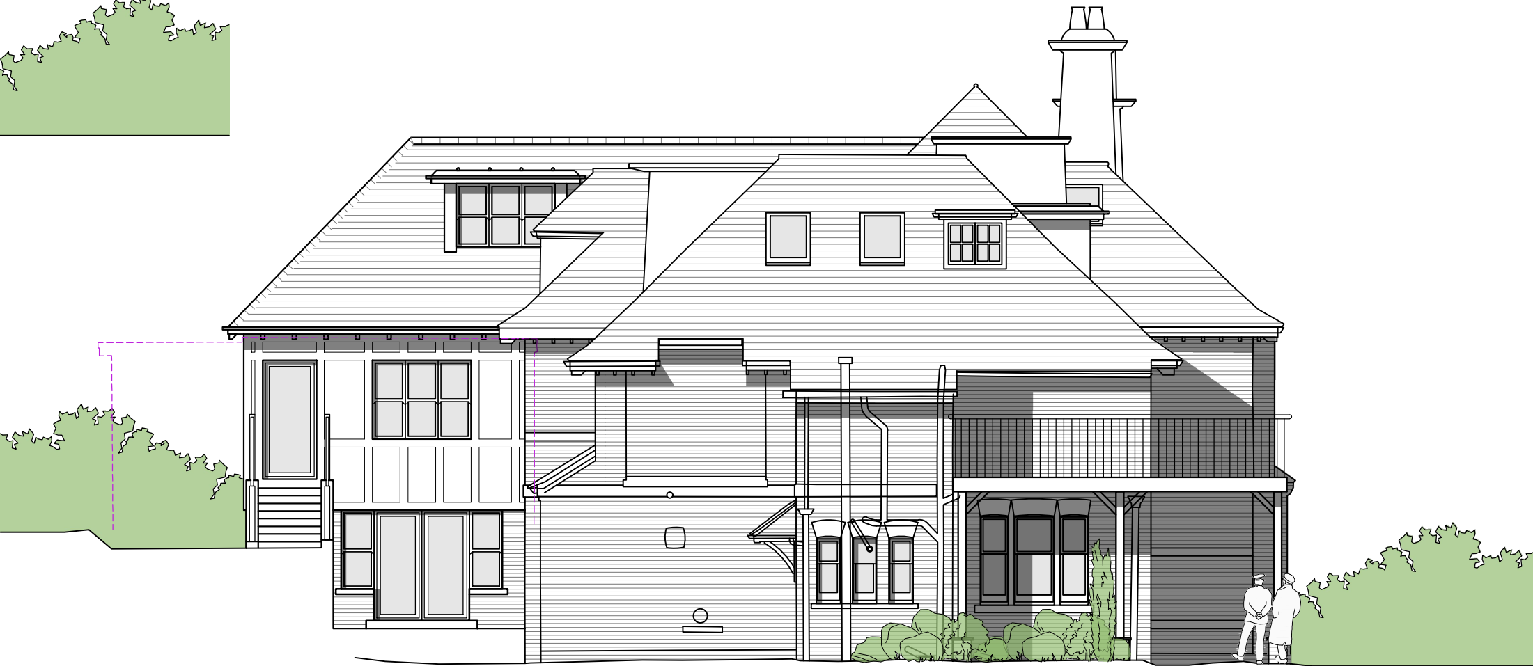
SIDE SOUTH WEST ELEVATION SCALE 1:100