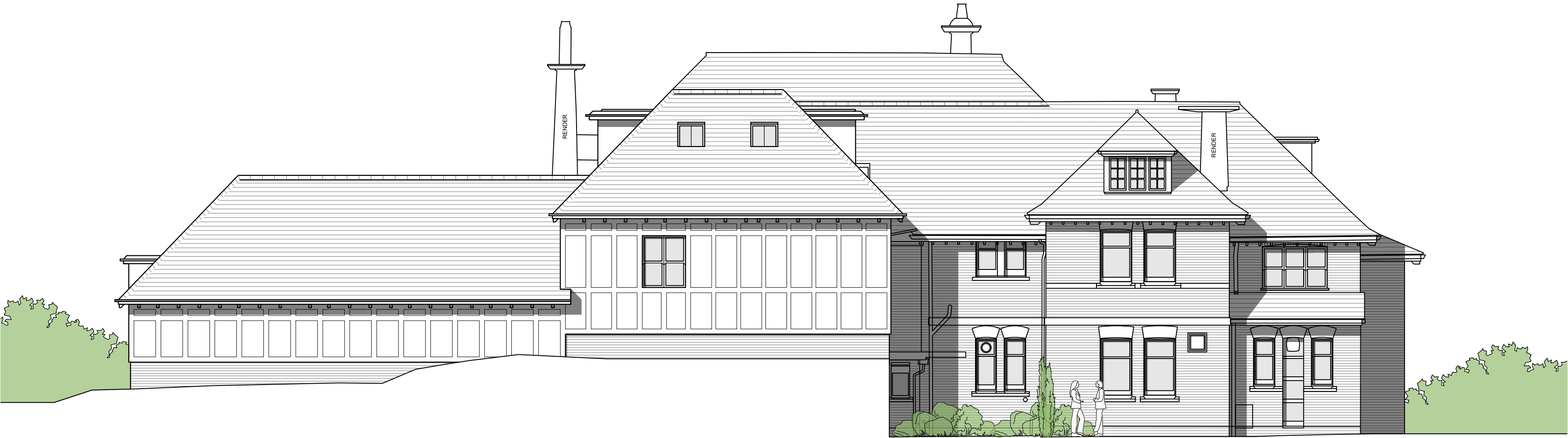
REAR NORTH WEST ELEVATION SCALE 1:100