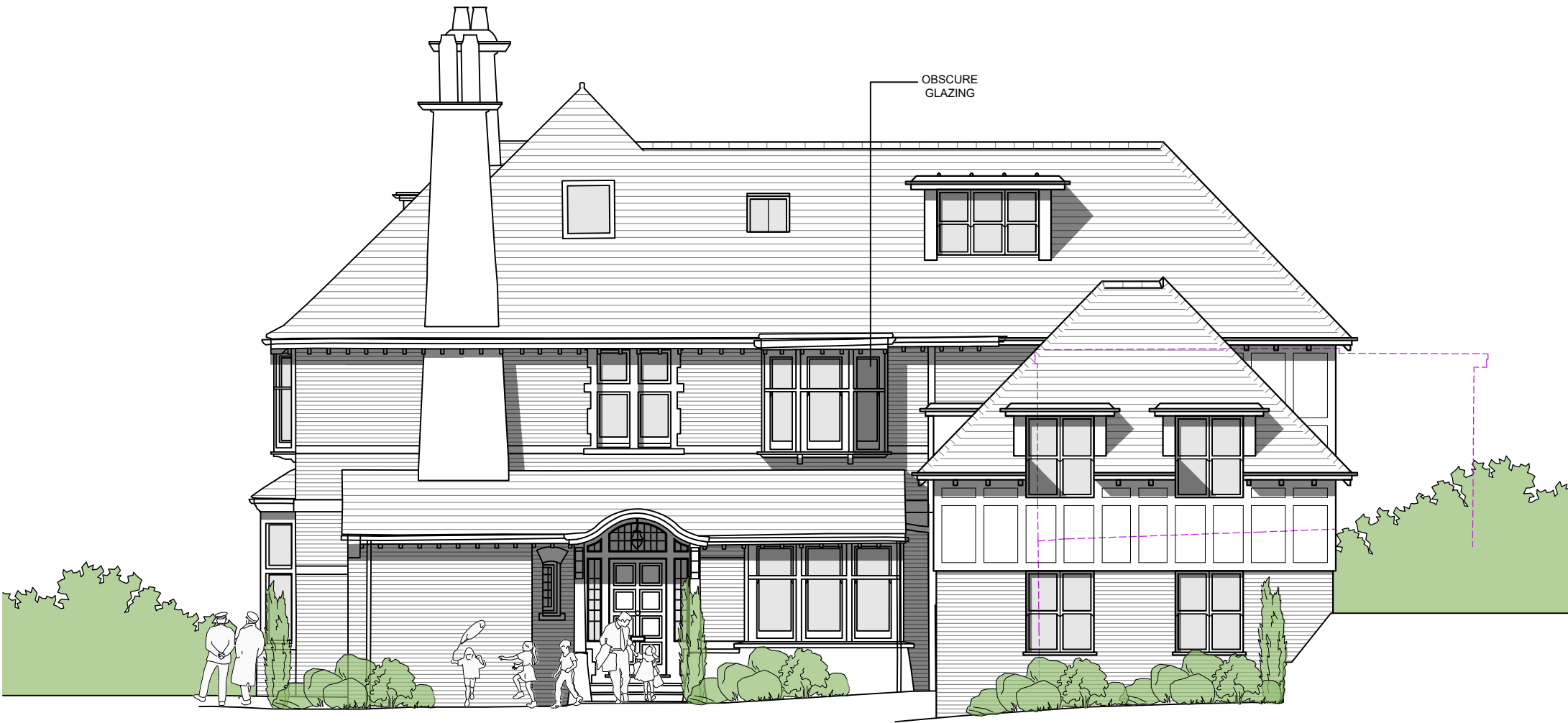
SIDE NORTH EAST ELEVATION SCALE 1:100